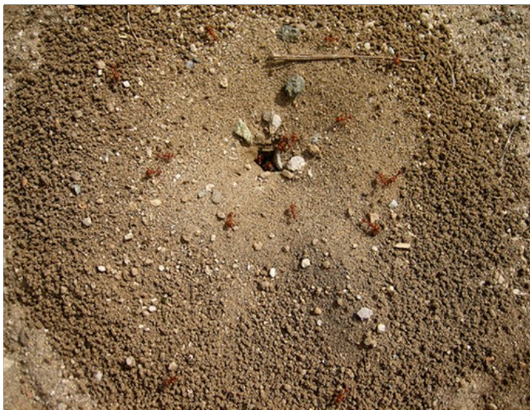
Fig. 1. Ants (macroarthropods) are among the soil bioengineers. They excavate macropores and mix soil through their burrowing activity (pedoturbation).