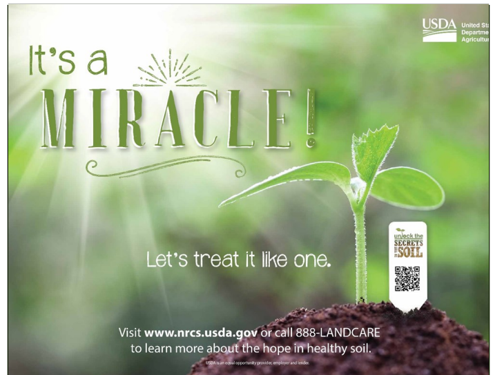
Fig. 4. The campaign’s use of out-of-home/outdoor ads like the one shown here and other integrated marketing communications vehicles, will help reach a number of targeted groups including non-operator landowners.

has exceeded supply. The 2015 Cover Crop Survey conducted by Sustainable Agriculture Research & Education (SARE) indicates that farmers are naming “soil health” as the most important reason to use cover crops in their organization indicating a significant increase in the awareness and benefits of soil health as a result of the campaign.