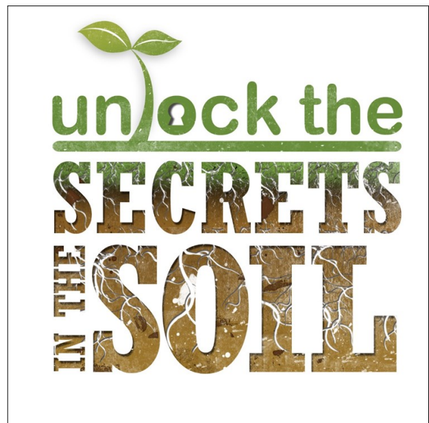
Fig. 2. In October, 2012, the NRCS launched its “Unlock the Secrets in the Soil” awareness and education campaign.