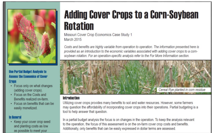
Fig. 3. A case study of adding cover crops to a corn soybean rotation in Missouri.