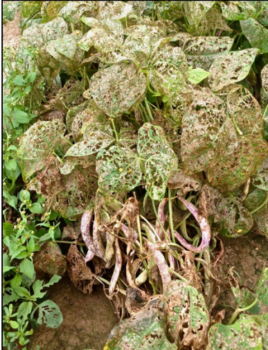
Fig 3. MBB damage on snap

Mexican bean beetle is native to the plateau region of Mexico. In 1918, MBB appeared in Alabama and quickly increased its range to cover the entire East Coast, from Florida to New England. A 2013 grower survey showed MBB to be most commonly found in the Appalachian region of the mid-Atlantic, especially in organic agricultural systems. There are sparse populations in the Rocky Mountains and Great Plains. MBB is uncommon in Pacific Coast states.