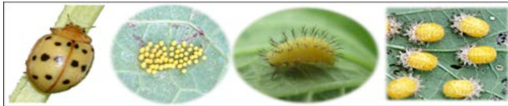
Fig 1. Mexican bean beetle adult, eggs, larva and pupae.

Mexican Bean Beetle (MBB) , Epilachna varivestis Mulsant (Fig. 1), is an herbivorous lady beetle (Coccinellidae) that feeds on bean crops (legumes) in North America. It is similar to the squash lady beetle, Epilachna borealis , which feeds primarily on cucurbits. MBB can cause significant defoliation damage to various bean crops particularly in the genus Phaseolus (snap beans, lima beans, pole beans, etc.). It will also feed on soybean, alfalfa, beggarweed, kudzu, and other legumes.