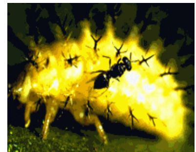
Fig 4. Pediobius on MBB larva

Biological Control: A parasitoid wasp, Pediobius foveolatus , is available for purchase. The wasp has been shown to prevent between 70 to 100% yield loss resulting from MBB. However, timing of the release is critical and it can take up to three weeks to receive wasps in the mail. It is best to release the wasp when MBB larvae first appear. Because it is native to India, it is unable to survive winters in a temperate climate; therefore, wasps must be purchased and released annually.